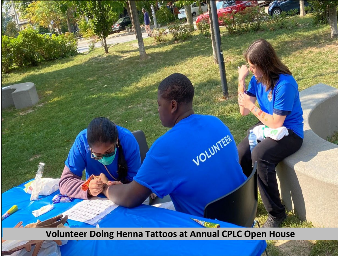
Volunteer Doing Henna Tattoos at Annual CPLC Open House