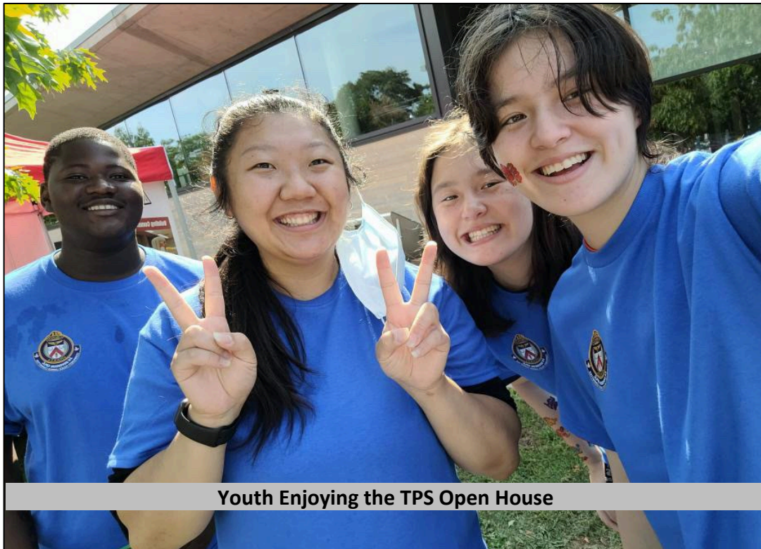
Youth Enjoying the TPS Open House