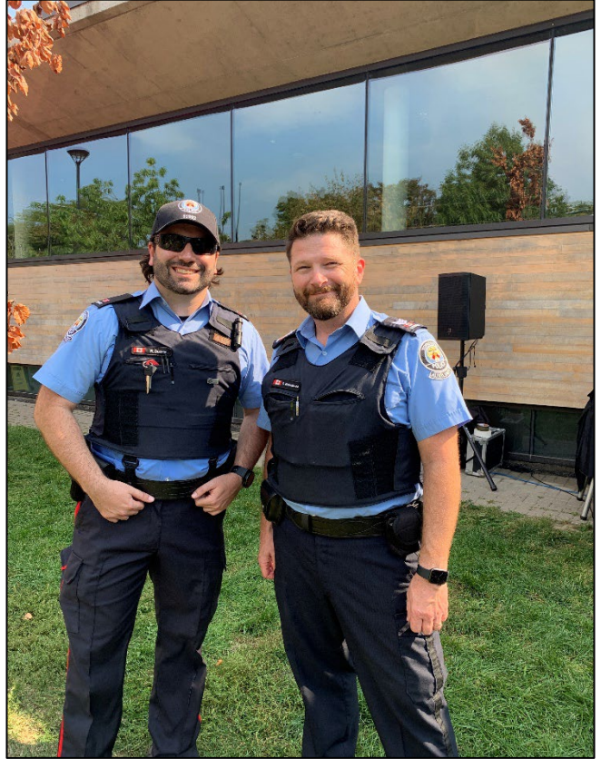
TPS Family Members at TPS Open House